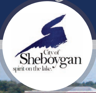
Figure 1-1: City of Sheboygan A diverse and prosperous coastal community Comprehensive Plan Vision